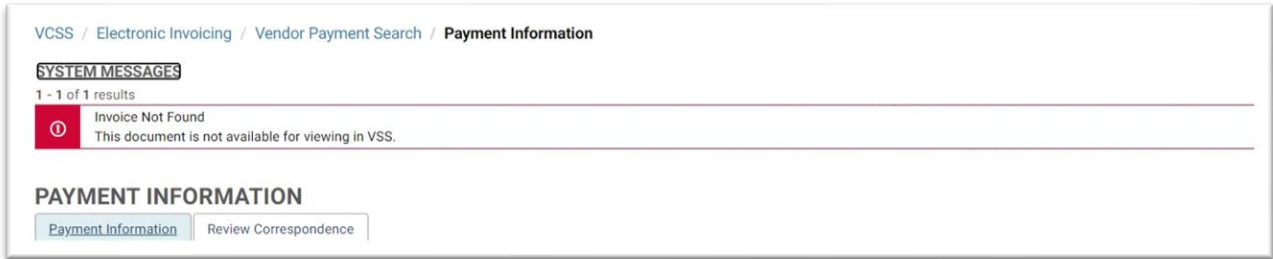
Figure 13: Referenced Invoice Message

The referenced Invoice Information page displays or a message displays stating that the document is not available for viewing in VCSS.